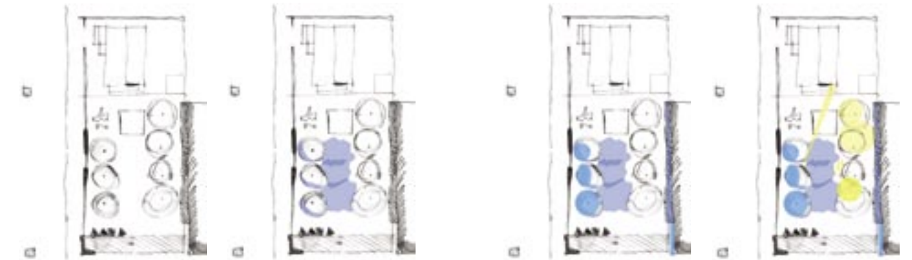
site plan cold-/moonlight cold-/moonlight, canope – tree-/uplight warehouse – backlight cold-/moonlight, canope – tree-/uplight warehouse – backlight warm-/tree downlight