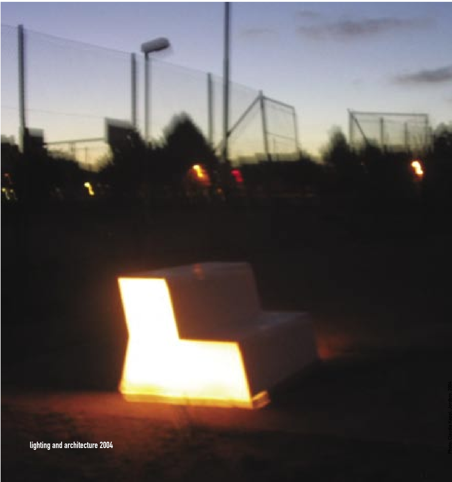
lighting and architecture 2004